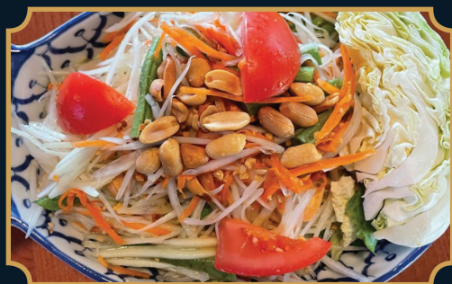
Green Papaya Salad