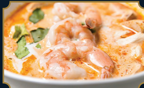
Tom Kha Shrimp