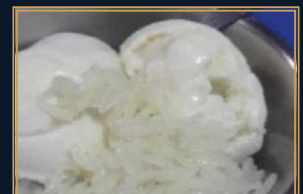
Sweet Sticky Rice w/Ice Cream