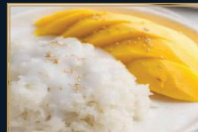
Sweet Sticky Rice w/Mango