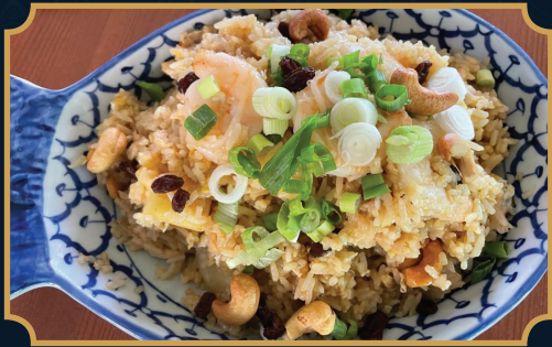
Pineapple Fried Rice