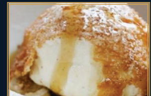
Fried Ice Cream