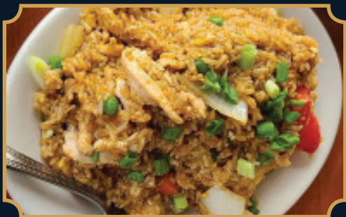
Combinations Fried Rice