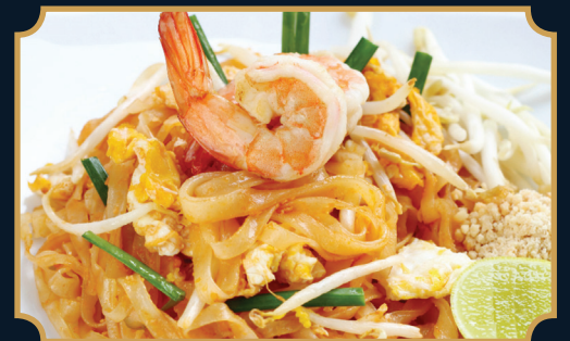
Pad Thai Noodles

Vegetarian Choice of: Tofu, Veggie or Mock Duck 15.95